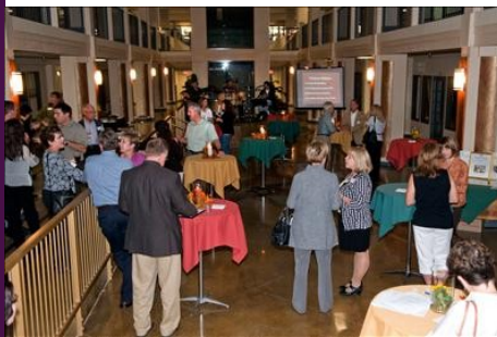
The Atrium with its inviting atmosphere...

The Steering Committee decided to go forward with the idea at our summer planning session and we put it into our budget.